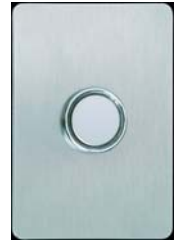
Figure 2: Hall Call

In the event of a building power failure, the door system is provided with a temporary power back-up system to continue the opening operation for a number of times. On resuming normal building power, the back-up system will turn OFF and begin automatic recharging.